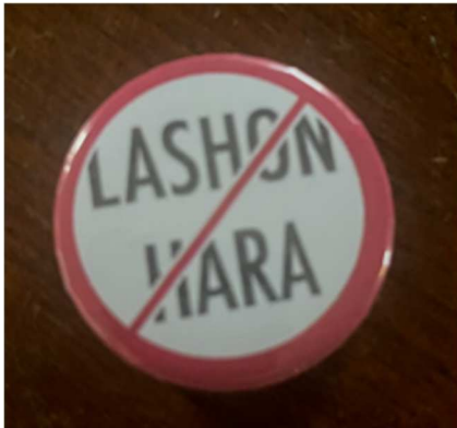
Azor khofshi Lashon HaRa Defamation-free zone