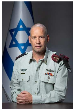
Yaron Finkelman ירון פינקלמן (born 1975) is an Israeli major general who commands the Southern Command of the Israel Defense Forces. 1993-present