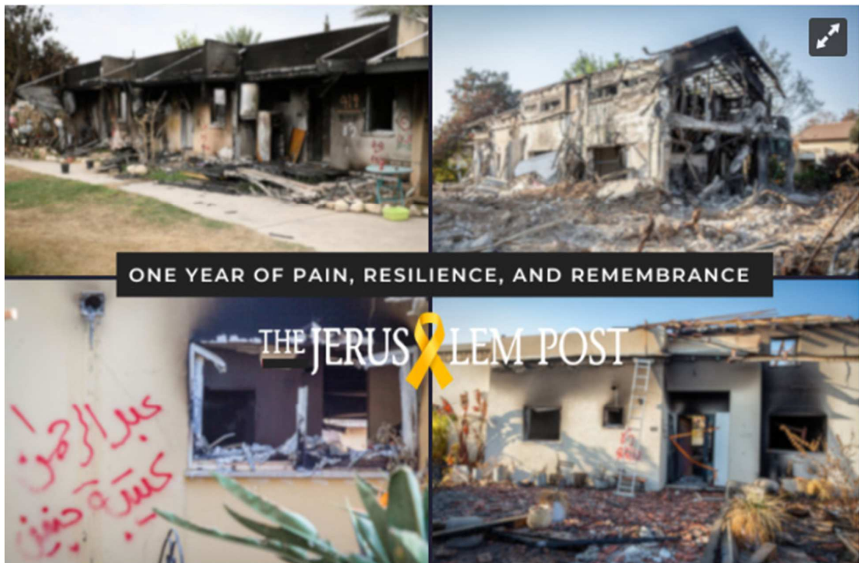
A year to October 7: Marking one year of pain, resilience, and remembrance