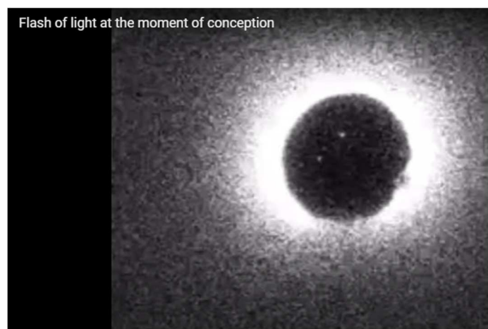
Flash of light at the moment of conception

Death: earthly citizenship to eternal citizenship]