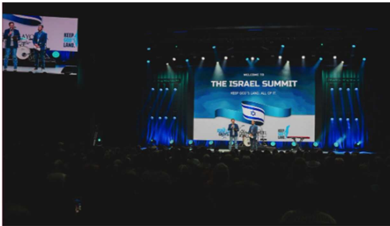
The Israel Summit 2024

Jihadi Protests Nixed an Upcoming pro-Israel Summit in TX